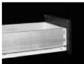
Non Soft Close Glide

Note: Somerset is not available for construction changes.