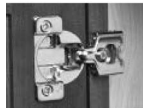
Non Soft Close Hinge