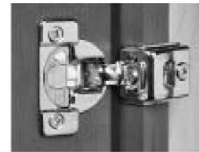
Soft Close Hinge

Note: Soft Close Hinge not available in Saginaw