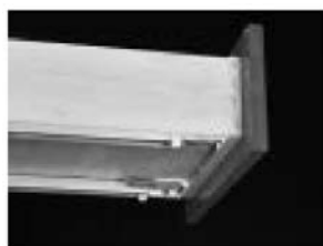
Soft Close Glide